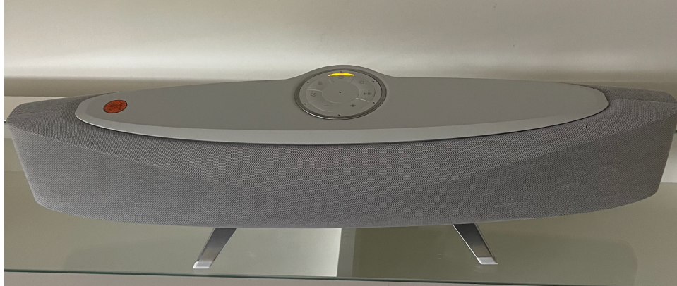
Green Light- Device is on